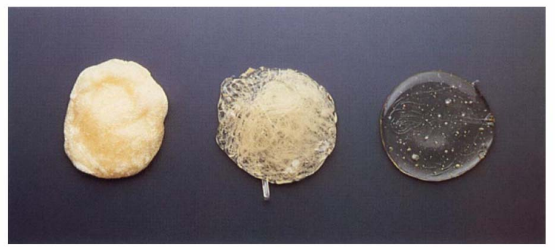
Resin after drying 1 hour Resin after drying 2 hours Resin after drying 3 hours Recommended minimum drying time: 4 hours